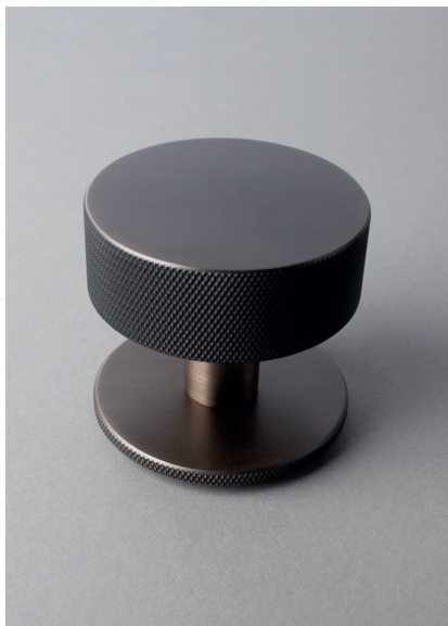
CENTRE DOOR KNOBS