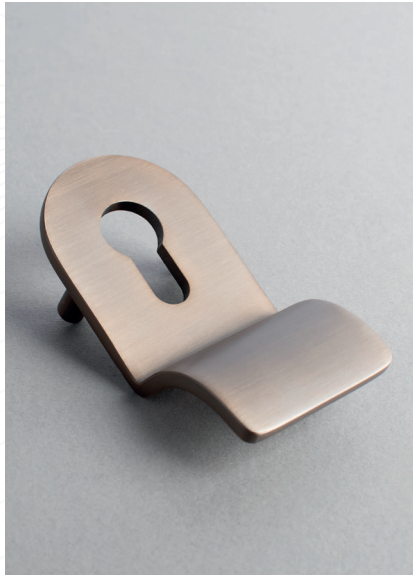
ESCUTCHEONS & PULLS