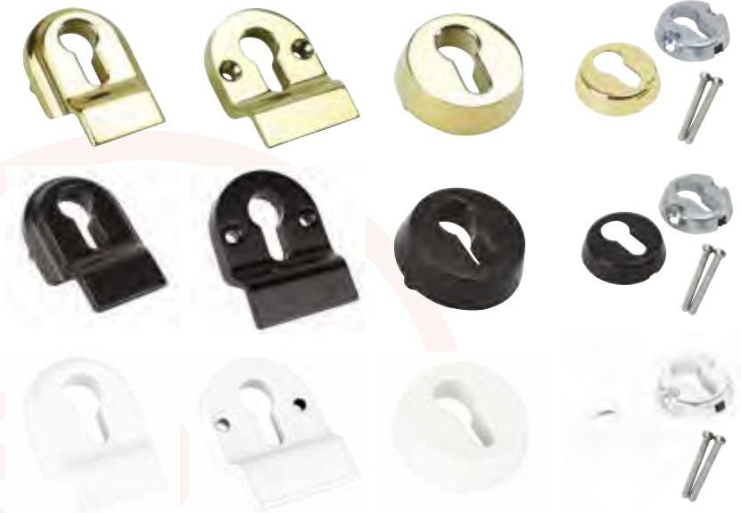
INTERNAL ESCUTCHEON 15mm Depth