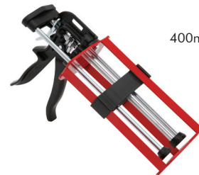
400ml Extrusion Tool

Once the damaged, decayed and discoloured wood has been removed by use of a suitable cutter tool such as a router or chisel, then the area to be treated is lightly sanded to ensure excellent adhesion. The moisture content of the wood should be no greater than 18% (check using a standard moisture meter) and damp wood should be allowed to dry naturally, or by way of a hot air gun. The two components are mixed manually into a separate container, and thoroughly agitated for one minute. The 2:1 mixing ratio should be strictly observed. EWS should be applied directly onto bare wood in the repair area using a standard brush and then left to cure for 20 minutes, prior to carrying out the repair. The repair can then be applied when the EWS is wet or fully cured. Please refer directly to the Timbabuild® EWS data sheet for more details.