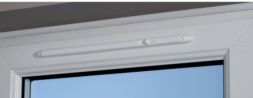
Trimvent® Select Xtra S13 Ventilator