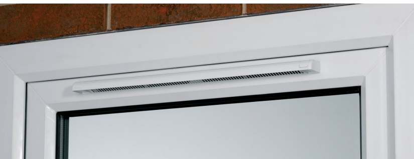
Trimvent® Select Xtra XC13 Canopy