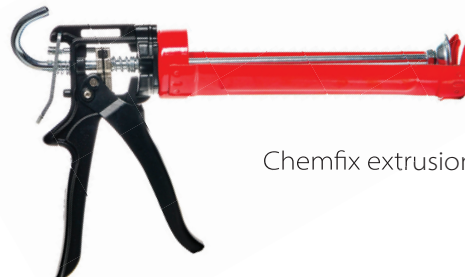
Chemfix extrusion tool.